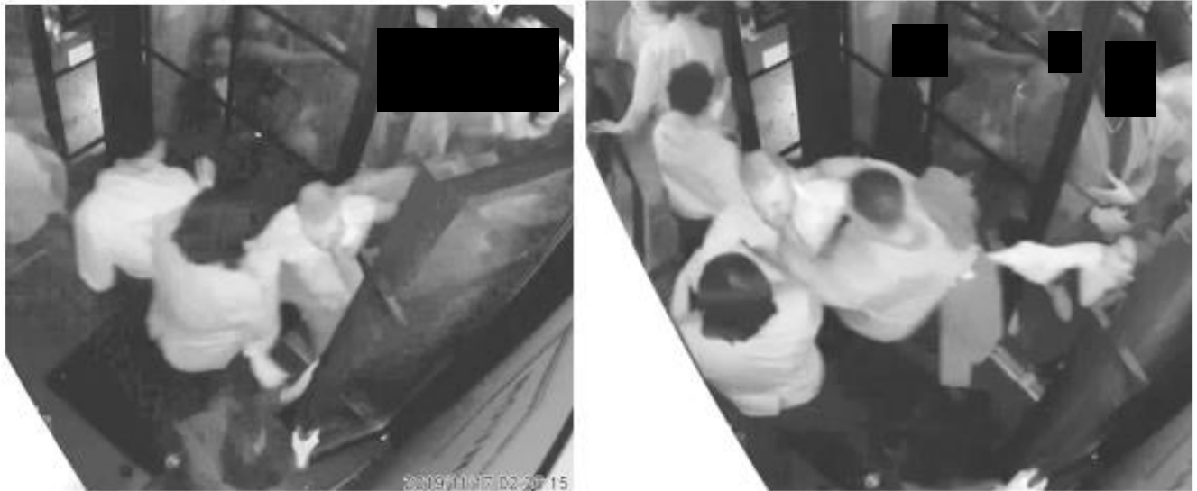
Figure 4: Screenshots from Att. 40, Bounce surveillance footage at 0:03.