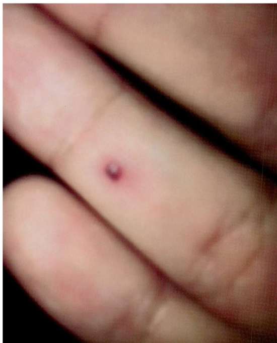
Contusion on the finger of ██████