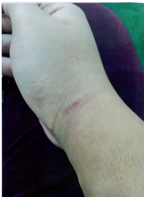
Bruise to the right wrist of ██████