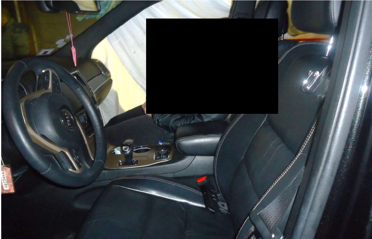
Figure 2. Photo taken by the ME's investigator showing the position of Sgt. Rice in the passenger's seat and her Ruger pistol on the driver's seat.

The Inventory Sheets 47 and Crime Scene Processing Reports 48 document the recovery of evidence from the shooting scene. The Jeep, which was parked in the alley behind [REDACTED], was a black 2014 Jeep Grand Cherokee registered to Sgt. Rice, bearing IL law enforcement license plates "[REDACTED]." An ET recovered the Ruger pistol from the driver's seat and one fired cartridge case (headstamped "F C 380 auto") from the front passenger's side floorboard. An ET also recovered Sgt. Rice's purse from the front passenger's side floor and turned it over to Sgt. William Svilar #1961, along with Sgt. Rice's cell phone, keys, and star.