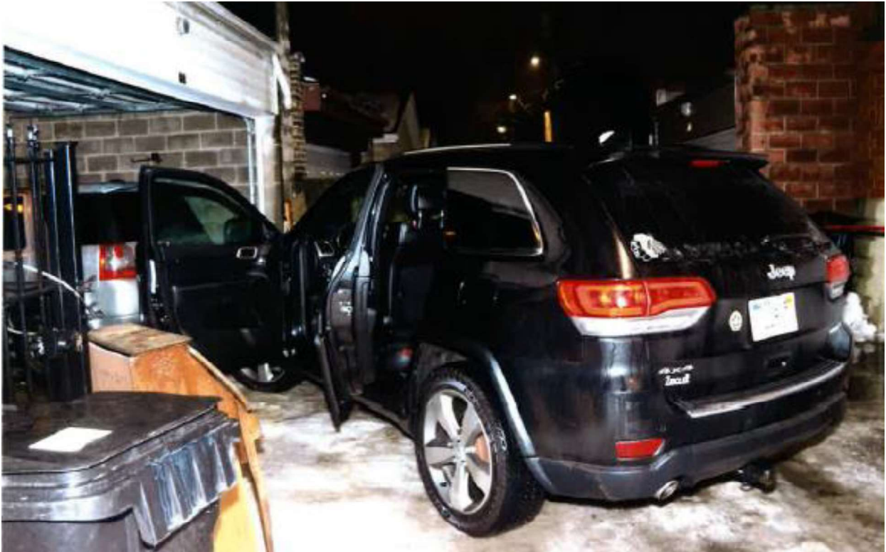
Figure 1. ET's photo showing the position of the Jeep in the alley at the time of the incident.

The photos also document a black Ruger pistol on the inside corner of the driver's seat, next to the seat belt release, and one fired cartridge case on the left side of the front passenger's floorboard. ETs photographed the Ruger pistol, a magazine with five live rounds, and one live round recovered from the chamber of the weapon. Additionally, the photos include images of Sgt. Garza's weapon, magazine, and holster inside Sgt. Rice's apartment.