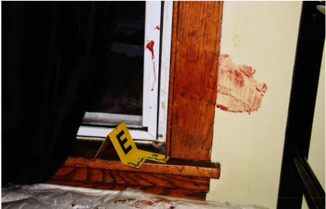
Photograph of blood on the bedroom window where Subject 1 entered XXXX N. Laramie